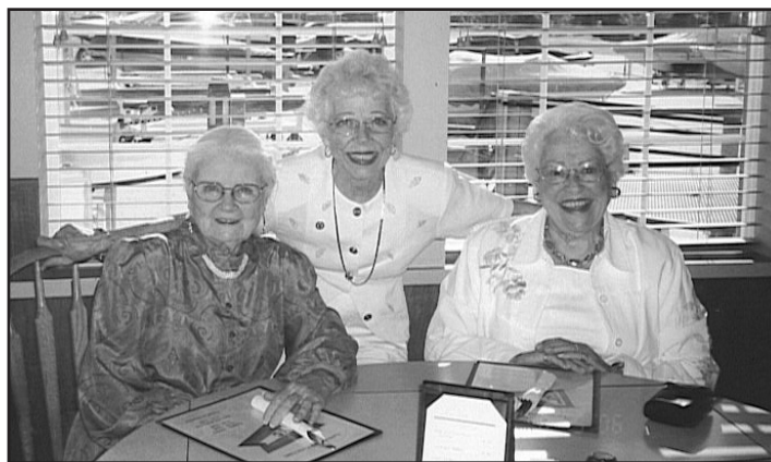
Alums from the early classes of Marycrest

The Earth Charter is a declaration of fundamental principles for building a just, sustainable and peaceful global society in the 21st Century. Through music, arts, speakers, workshops, and panel and discussion groups, the summit will bring people together to identify creative and realistic actions to implement Earth Charter principles in their families, work places, faith communities and organizations. Visit www.quadcityearthchartersummit.org for more information.